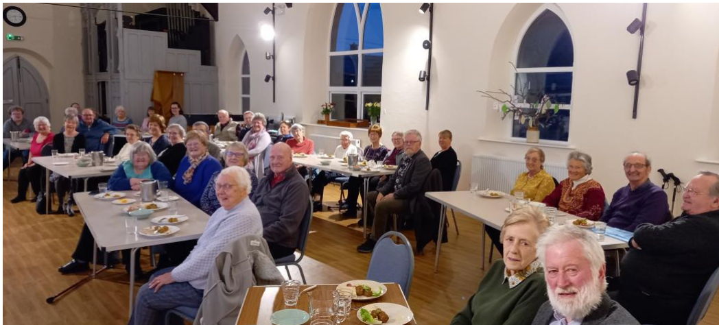
The United Area Seder meal and service held on Maundy Thursday

We host the Stroke Support Club on the 2nd Monday of the month, late morning. Most Saturday mornings of the year various charities host Coffee Mornings to raise funds. These are a focal point for many Dalton folk. We are also available for children's birthday parties and other bookings.